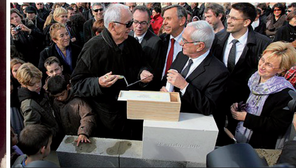
Laying of first stone