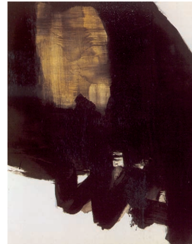
Peinture sur toile, 162 x 130 cm, 1 er juin 1964 © Soulages Museum, donated by Pierre and Colette Soulages