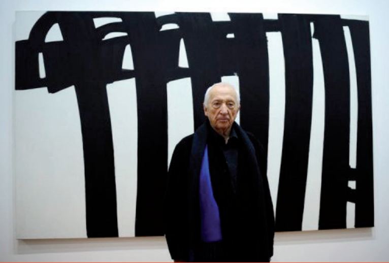
Pierre Soulages

On October 20th, 2010 the first stone of Soulages Museum was laid. Its inauguration, planned for summer, 2013, will present this exceptional donation and will be marked by a quality international exhibition (dimension /size; or large-scale).